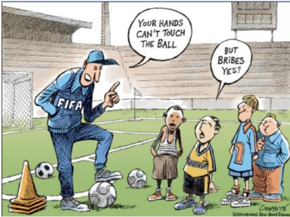
The International New York Times [Click Here for NYT Opinion Page]