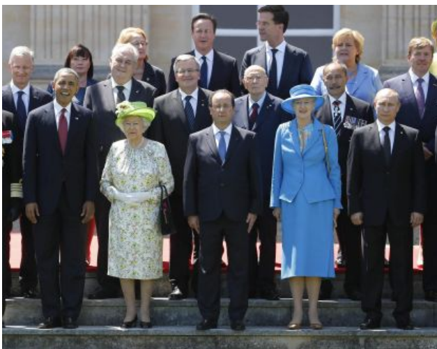
Leaders gather for D-Day 2014: President Obama, front left, and French President Francois Hollande, front center, with Queen Elizabeth II, 2nd left, President Vladimir Putin, front right, and others, in Normandy.

So when Obama now says: “Our commitment to the security of our allies is sacrosanct,” which would have delighted my grandparents, only serve to sicken me. Because in reality, this just means: If necessary, we will defend our financial interests around the world by force of arms. At the D-Day celebrations, things will no doubt sound very different.