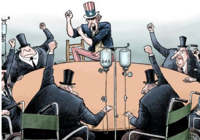
China Daily, China [Click Here for More State-Run China Daily Cartoons]